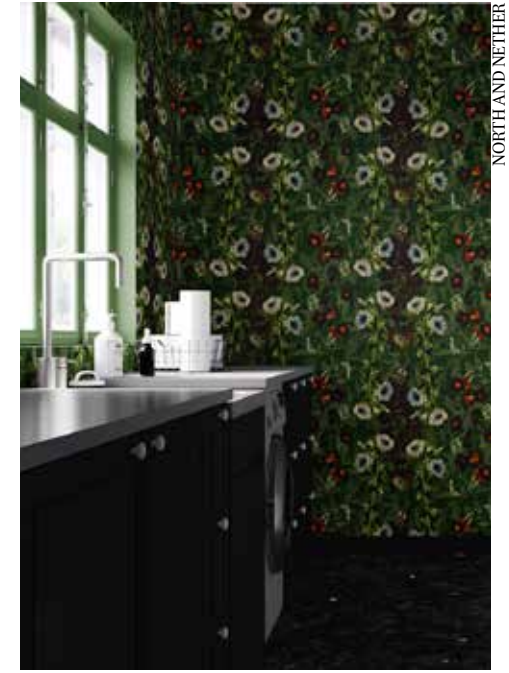
ROLL UP: Midnight Garden wallpaper makes for a dark but natural pleasure.

Wallpaper designs to turn home into gallery