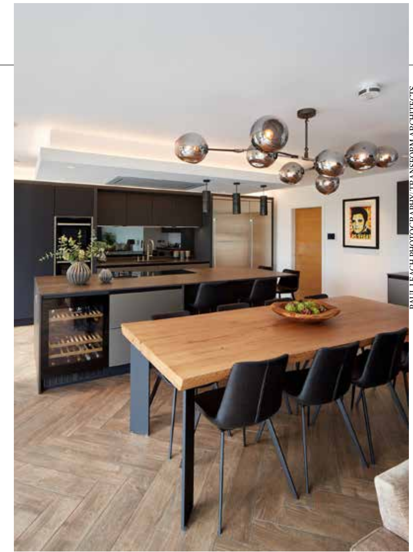
PAUL LEACH PHOTOGRAPHY/TRANSFORM ARCHITECTS

LET THERE BE LIGHT: The interior space was carefully planned by Ossett-based Transform Architects and works perfectly for the family of four. Large areas of glazing bring in natural light and views and the lower ground floor has allowed space for a swimming pool and a home bar, which were a blessing in lockdown. The kitchen is from Inspired Designs in Morley and the dining table is from the Redbrick Mill store in Batley.